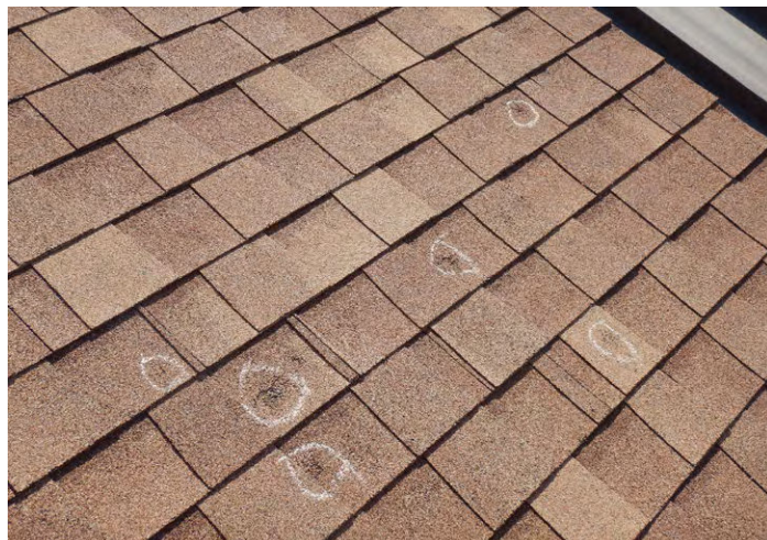
Hail damage on a shingled roof.

A falling hailstone can have substantial kinetic energy. When it collides with a building material, the hailstone transfers a portion of that energy—its impact energy—to the struck surface. Impact energy is a function of the hailstone's size, density, and impact velocity. Larger hailstones, which are more massive and fall at a faster speed than smaller hailstones, have a much greater impact energy than smaller hailstones. In fact, a 2 in. diameter hailstone can deliver more than twenty times the impact energy of a 1 in. hailstone. With sufficient impact energy, hailstones can crack, fracture, or puncture roofing and exterior wall materials, shortening the material's lifespan or, in severe cases, causing holes that can allow water penetration.