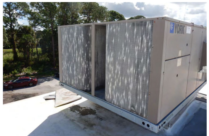
Hail damage on rooftop HVAC equipment.

Roofing material selection also plays a critical role. Asphalt shingles not rated for hail tend to be on the lower end of the hail-damage resistance scale and may begin to experience granule loss with hail over about 1 in. Single-ply membrane damage and cosmetic damage to metal roofing can occur with hail 1.5 in. or larger, and 2 in. hail can begin to damage more robust roofing materials such as concrete tile and built-up roofing.