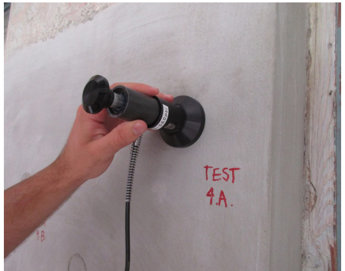
Adhesion test at 215 Market Street, San Francisco, CA.