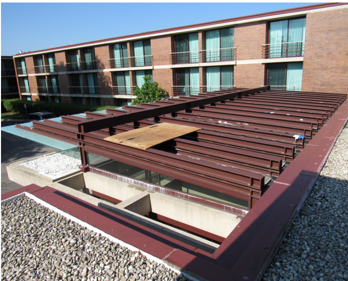
Hyatt Lodge at McDonald's Campus, Oak Brook, IL.