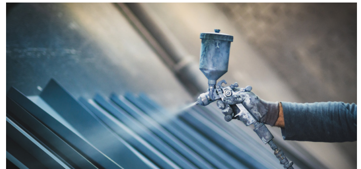
It is important to use proper application techniques to avoid premature coating failure.

In many investigations, these factors play a central role in premature coating distress.