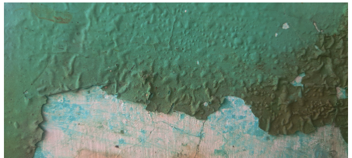
Top: checking, alligating, and cracking; top middle: delamination; bottom middle: craters, fisheyes, and pinholes; bottom: runs, sags, and wrinkling.