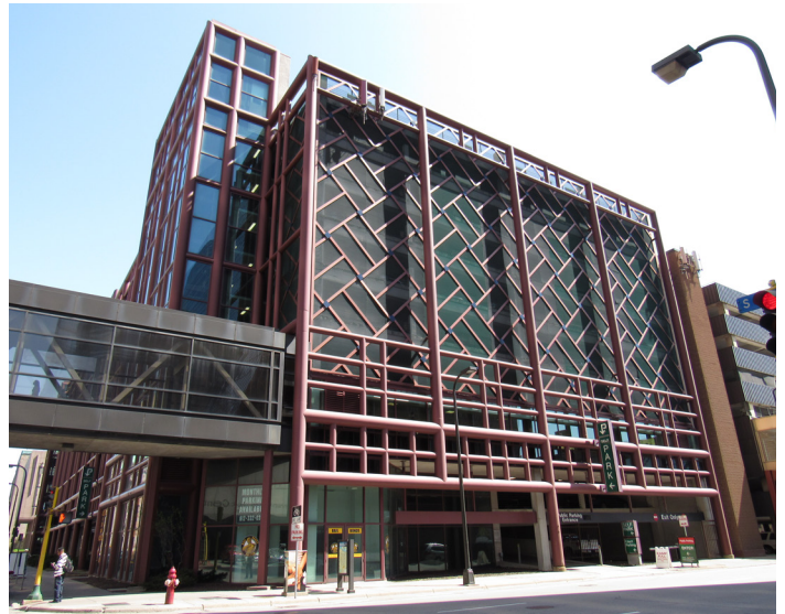
The Opus Garage, Minneapolis, MN.

While coatings are sometimes treated as a finishing scope, they function as a primary durability system. A thoughtful, integrated approach to selection, application, and investigation can help project teams manage risk, extend service life, and make informed decisions when coating performance does not meet expectations.