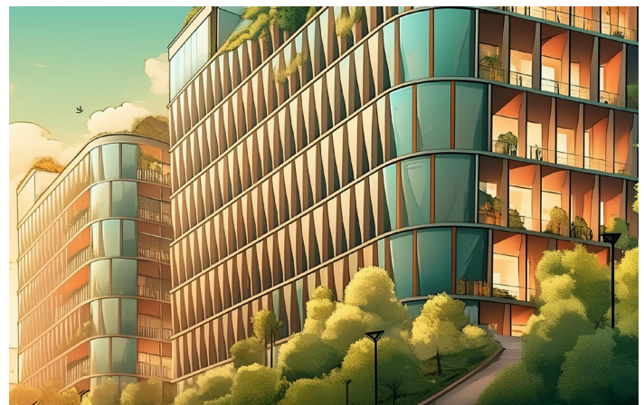
"Generate futuristic buildings using the reference image (top)." Generated with Adobe Firefly.