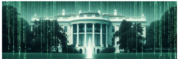
"Draw the White House using 0s and 1s." Generated with Bing Image Creator.

As of the publication of this article, there are no specific federal regulatory frameworks in place addressing the use of AI by professionals or any other professional community. However, in December 2020, the U.S. federal government issued Executive Order 13960, " Promoting the Use of Trustworthy Artificial Intelligence in the Federal Government ." Executive Order 13960 requires that certain federal agencies adhere to a prescribed set of principles when designing, developing, acquiring, or using AI for purposes other than national security or defense. According to the Executive Order, the federal government may use AI if it is: