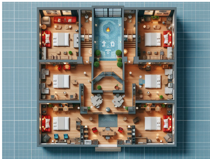
“Generate a hotel floor plan that satisfies the requirements of the latest edition of the Massachusetts Fire Code.” Generated with Bing Image Creator.

As a general practice guideline, AI uses should be discrete and involve specific requests rather than long, complicated inputs. For example, the AI query “generate a hotel floor plan that satisfies the requirements of the latest edition of the Massachusetts Fire Code” may generate a design that appears to satisfy the relevant code. However, it is not recommended to directly convert these results into construction documents. Given the nature of current generative AI (i.e., it may be trained on vast, uncurated datasets, including the entirety of the Internet), it is possible that the result generated is based on an outdated code version. While there is a trend toward using curated datasets, which are more reliable, these come at a significant cost. Furthermore, despite using carefully crafted queries, the risks remain: the AI-generated responses may miss critical amendments or revisions to the code, or produce designs that ultimately fail to comply with current regulations. Although AI-generated results can serve as a useful starting point for design exploration, they require thorough independent verification against the actual code to ensure compliance.